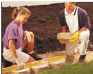
2. Place & Compact Backfill

Start by digging a shallow trench 4" (102mm) deep by 12" (305mm) wide. Cut through and remove any sod, roots or large rocks. For organic loam soils, dig 4" (102mm) deeper and add a leveling pad of sand or gravel. Compact and level the soil to receive the first course of Keystone Garden Wall.