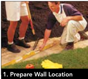
1. Prepare Wall Location

Start by digging a shallow trench 4" (102mm) deep by 12" (305mm) wide. Cut through and remove any sod, roots or large rocks. For organic loam soils, dig 4" (102mm) deeper and add a leveling pad of sand or gravel. Compact and level the soil to receive the first course of Keystone Garden Wall.