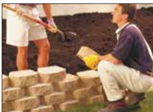
3. Install Additional Courses

Place and level the first Keystone Garden Wall unit. Level each additional unit on the base course as you place it, making sure that the outside edges touch. If your wall contains both straight and curved areas, start with a straight area and build into the curves. Complete the base course before proceeding to the second course.