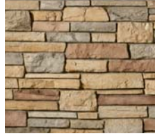
Carmel Country LedgeStone (CSV-20007)