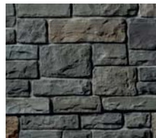
San Francisco Cobblefield LedgeStone (CSV-2037)