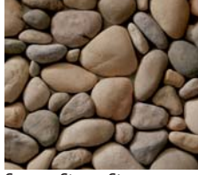
Summer Stream Stone (CSV-2071)