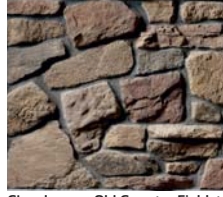
Chardonnay Old Country Fieldstone (CSV-368105)