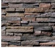
Pheasant Pro-Fit Alpine LedgeStone (CSV-420117)