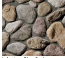
Lakeshore River Rock (CSV-2004)