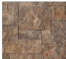
Chardonnay European Castle Stone (CSV-573786)