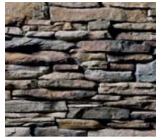
Bucks County Southern LedgeStone (CSV-2056)