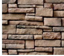
Chardonnay Drystack LedgeStone (CSV-2012)