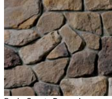
Bucks County Dressed Fieldstone (CSV-2030)