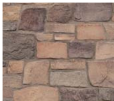
Toscana Ancient Villa LedgeStone® (CSV-499966)