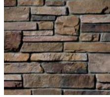
Bucks County Country LedgeStone (CSV-368183)