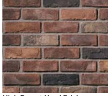
High Desert Used Brick (CB-418953)

To see our full product line visit www.culturedstone.com