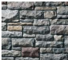
Suede Limestone (CSV-2046)