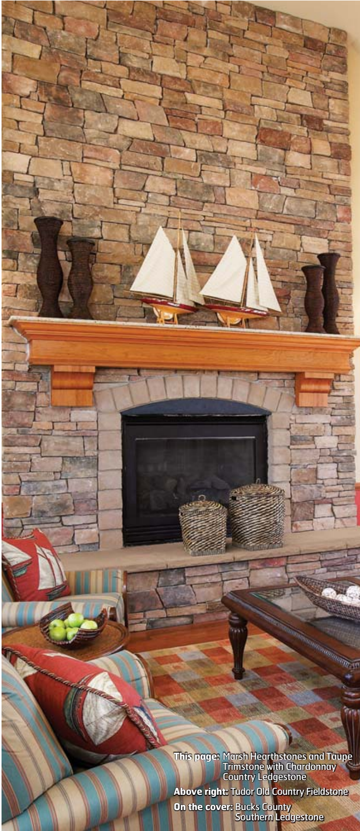
This page: Marsh Hearthstones and Taupe Trimstone with Chardonnay Country LedgeStone