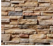
Harvest Pro-Fit Alpine LedgeStone (CSV-420114)