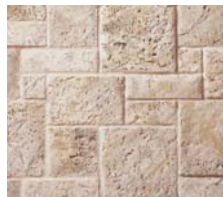
Fossil Reef Coral Stone (CSV-354399)