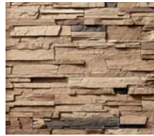
Mojave Pro-Fit LedgeStone (PF-8014)