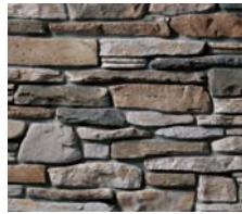
Aspen Southern LedgeStone (CSV-430778)