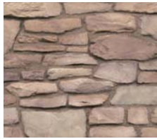
Barossa Del Mare LedgeStone® (CSV-498730)