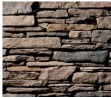
Chardonnay Southern LedgeStone (CSV-2054)